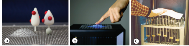
Figure 4: Three deformable surfaces: (a) Molebot, (b) Lumen, and (c) FEELEX.

Similarly, Poupyrev et al. [6] created Lumen (Figure 4b), an interactive display that presents both visual images and physical, moving shapes. The motions are described as smooth and continuous and serve to provide aesthetically pleasing, calm animations. With the Feelex project, Iwata et al. [2] explored using deformable surfaces for providing haptic feedback. They created an interactive Anomalocaris (a pre-historic creature) that appears to be in motion depending on the force applied by the user. If the user pushes its head, it reacts angrily and struggles.