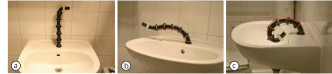
Figure 2: The thrifty faucet in three postures: (a) seeking, (b) curious, and (c) rejecting.

Several research projects in the area of shape-changing interfaces have sought to make use of animation to communicate information to users through lifelike movements; Rasmussen et al. [7] and Schmitz [8] offer extensive reviews. For example, Toggler et al. [10] created the Thrifty Faucet that communicates information on water consumption and hygiene to users through deforming its shape into various postures. If users forget to wash their hands, the Thrifty Faucet will stretch towards them to invite them to turn it on. In contrast, if users use too much water, the faucet will curl up to signal rejection.